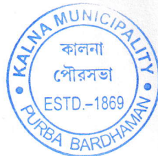
Chairman Kalna Municipality Chairman Kalna Municipality