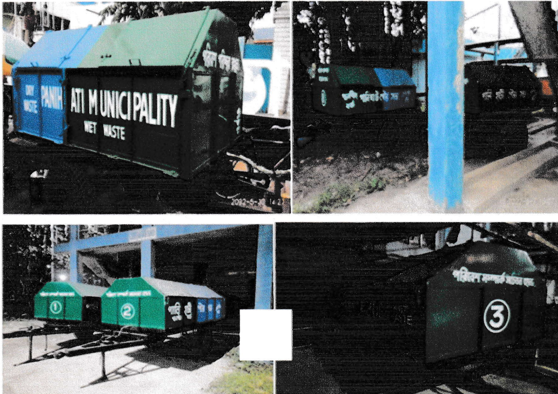
Pictorial description of Trailer